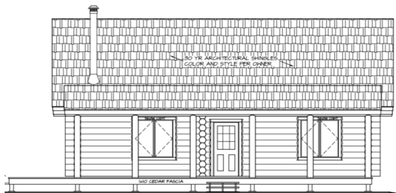
RIGHT SIDE ELEVATION SCALE = 1/4" = 1'-0"